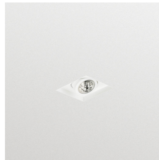
StoreFlux3 - LED Module, system flux 1200 lm