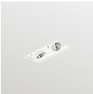
StoreFlux3 - LED Module, system flux 1700 lm