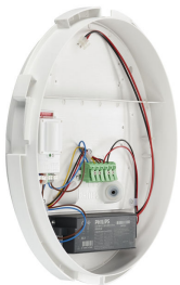
CoreLine_Wall-mounted- WL131V_D35_CTO_PSR_MDU- DPP.TIF