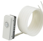
LRM8119/00 Lum Based Ext Sensor with LCA8004/00 COVER