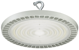
CoreLine High-bay Value BY101P