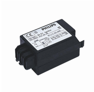
SN 58 T5