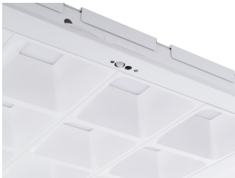
Power Balance G3 RC600B