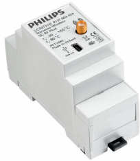
LCN7310/00 Starsense Wireless SC RF mod.